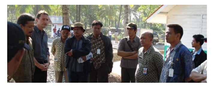
Discussion of tsunami impact zones based on the experience of tsunami 2006 in south Java on Widara Payung beach, Binangun Sub-district, Cilacap.

Participants from Kebumen working on delineation of tsunami impact sub-zones on maps (Cilacap Workshop 3<sup>rd</sup> May 2007)