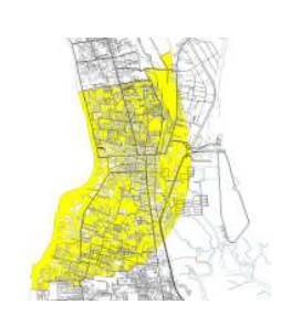
Kuta - Base Map

For the mapping process further data is required. In cooperation with different stakeholders (BMG, PMI) an applicable method to gain data by field work visits will be developed. The obtained data will be integrated in the mapping process to complete spatial elements as decision support for evacuation planning.