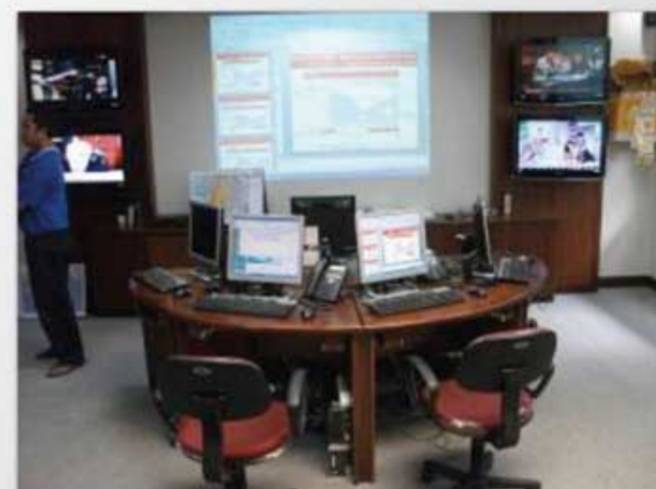
Tsunami Desk in PUSDALOPS Bali