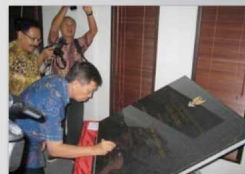
Inauguration of PUSDALOPS by Bali Governor