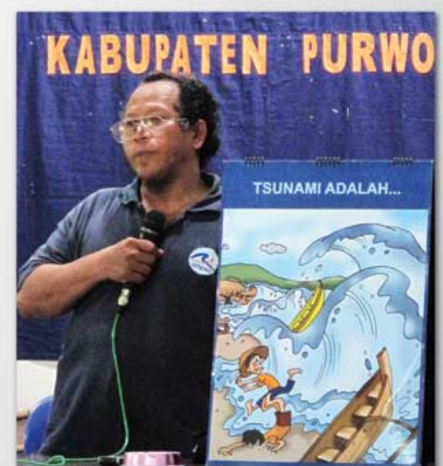
Facilitator Using Lembar Balik in Community Meeting