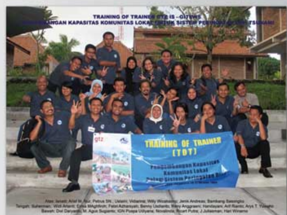
Master Trainers in ToT Yogyakarta, October 2009