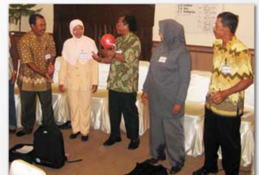
ToF in Bantul - Yogyakarta, December 2009

The training sequence started in October 2009 by preparing master trainers to implement training for community facilitators and build a community outreach network.