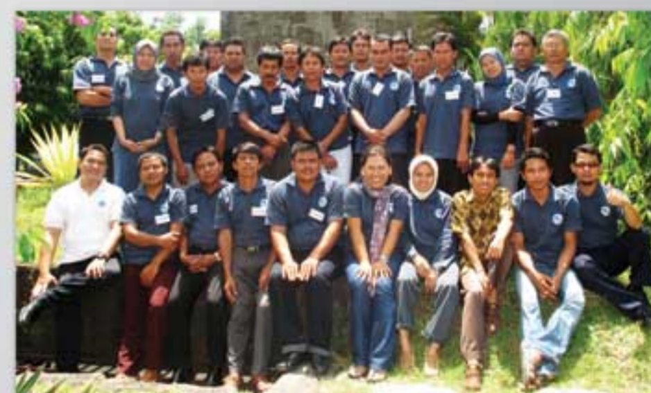
Facilitators in ToF Cilacap, December 2009