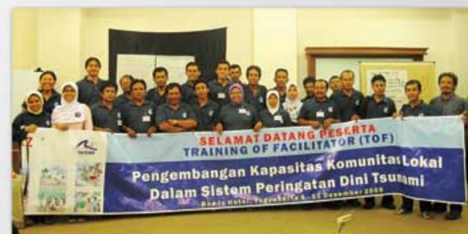
Facilitators in ToF Bantul - Yogyakarta, December 2009