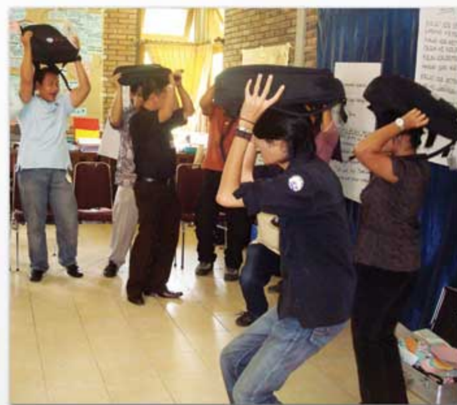
ToT in Yogyakarta, October 2009

This initiative involved the working groups in all three pilot areas, the Bali branch of the Indonesian Red Cross, IDEP Foundation in Bali, KOGAMI from Padang, MPBI based in Jakarta, and all local facilitators and master trainers. The development of the training modules involved the “Veteran” Pembangunan National University/ DREAM in Yogyakarta and PREMANet Indonesia.