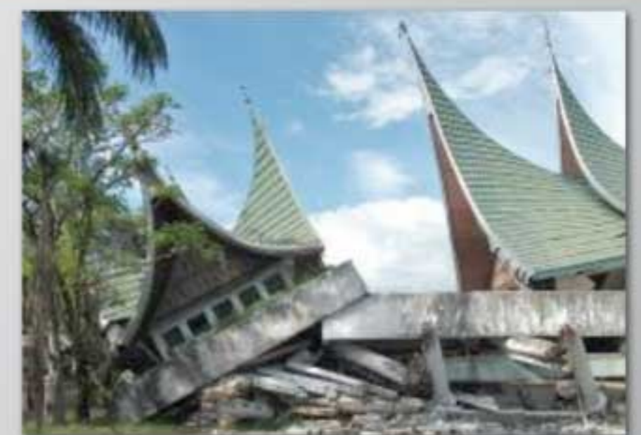
Building Damage by Earthquake in 2009

Tools for the assessment of local tsunami response capacity