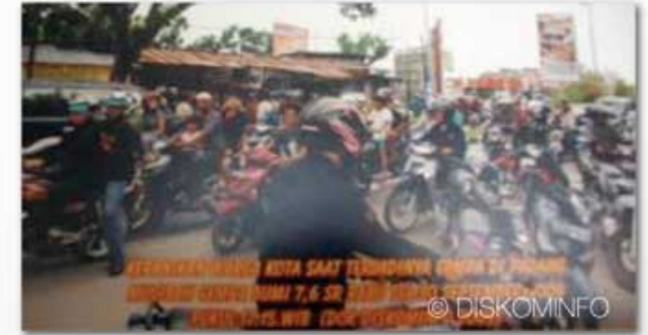
People Evacuating in Padang on 30 September 2009

If well-assessed, conducted not long after the event, well-presented, and accompanied by practical, down-to-earth recommendations, case studies on the response capacity of coastal communities provide the means to effectively use the momentum created by an earthquake and a tsunami warning to increase tsunami preparedness planning and support the development of early warning. They create the rare opportunity for a direct dialogue with local policy and decision makers and other stakeholders who now feel the need for action. Government institutions, NGOs, universities, and other actors in tsunami prone communities in Indonesia should use this opportunity to advocate for preparedness, create awareness and prepare their communities for potential future earthquakes and tsunamis.