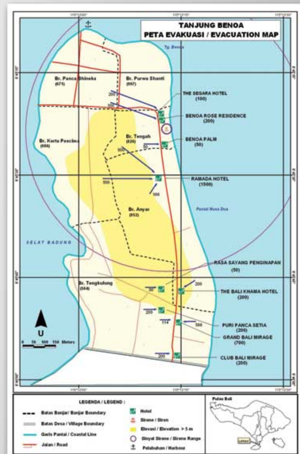
Evacuation Map and Procedures for Tanjung Benoa, Bali

Get familiar with safety rules for earthquakes and tsunamis. For further information please contact the Lurah office or the local SIBAT Team.